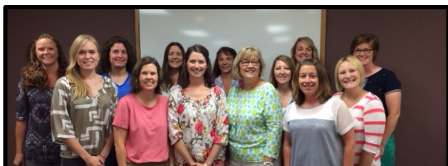
SMNCN founding board members, 2017